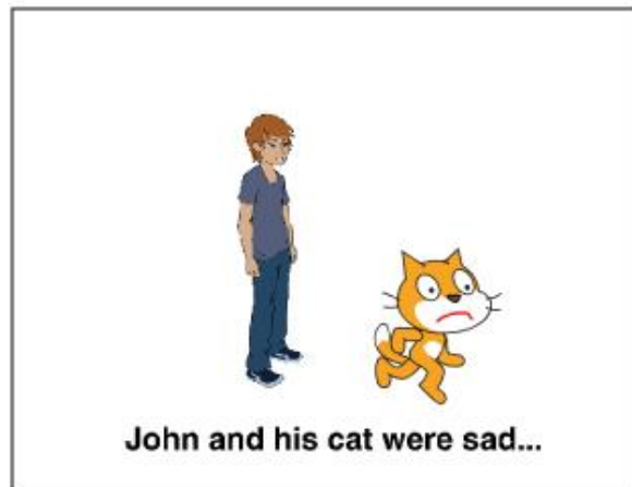
When creating an animation, you create the sequence of the story before using computer software, such as Scratch to create it.

Computational thinking is not thinking about computers or like computers. Computers don't think for themselves. Not yet, at least!