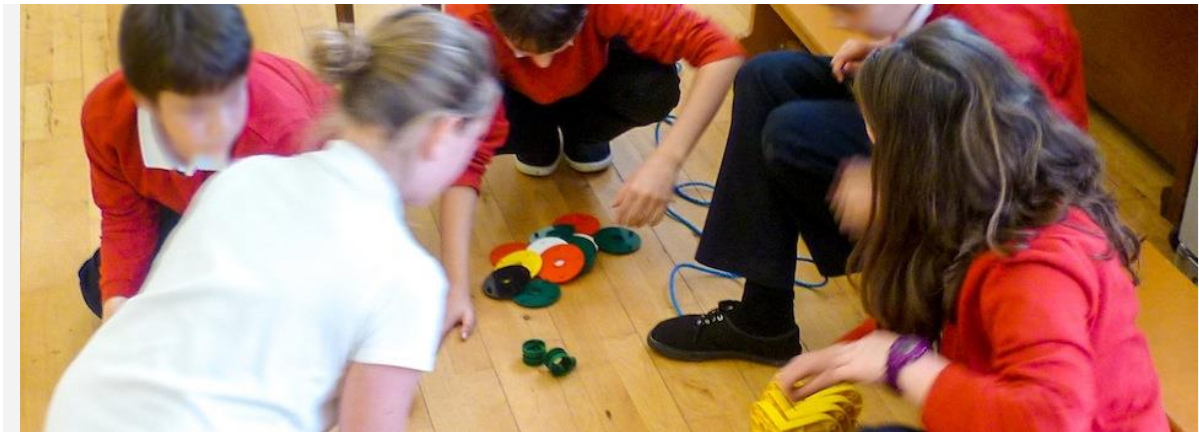
Pupils from Henley Primary School are doing a great deal of computational thinking as they consider the best way to build a robot.